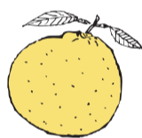
柚子 / YUZU Japanese citron

Served w/ Japanese-citron soup in a hot pot.